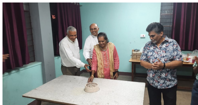
Pics from the Thanksgiving Mass & celebration of the 40th founding Anniversary of the ICPE Mission, along with ICPE Bangalore