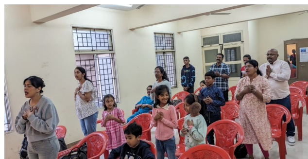
Pics from the 1st community meeting of 2025